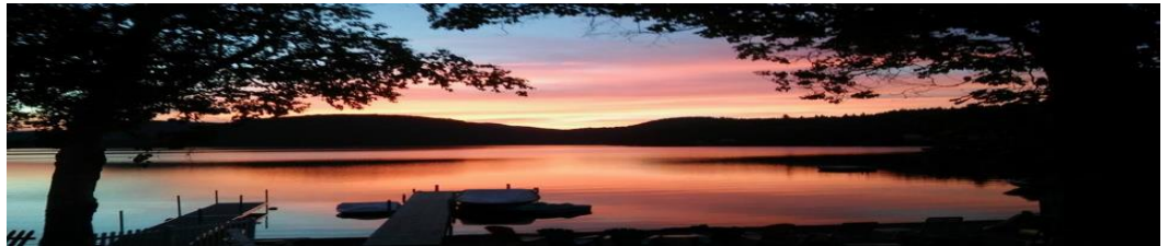
Tranquil Sunset

If you would like to be on the Shadow Lake Association Board, please contact any board member or go to our website: director application. Every year there are openings available due to term limits, etc. & the annual election of President & Secretary. There are so many ways to show support for the lake!