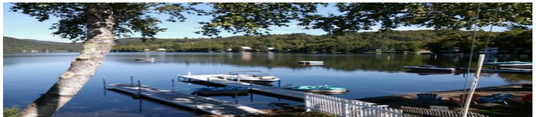
A Calm Summer Day

Vermont had a long winter with lots of record breaking snowfalls! Shadow Lake is just getting rid of her ice & snowbanks; April 21 the last of the ice melted away. We are all getting the itch to enjoy time at the lake!