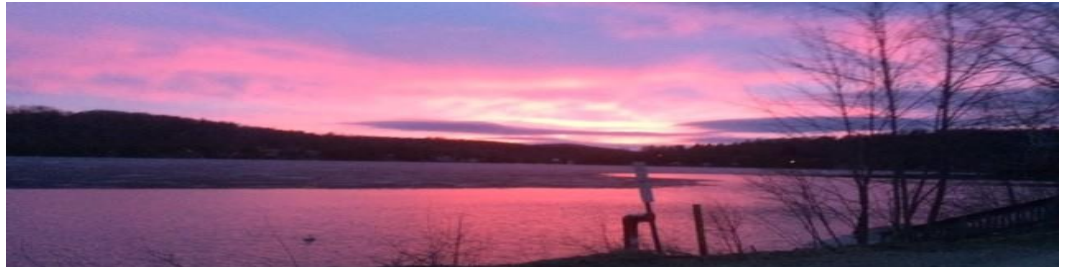
Spring Sunrise, still ice in the center

Vermont had a long winter with lots of record breaking snowfalls! Shadow Lake is just getting rid of her ice & snowbanks; April 21 the last of the ice melted away. We are all getting the itch to enjoy time at the lake!