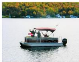
Final Dive of the Year