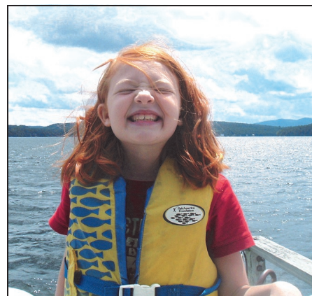
Lakeshore conservation benefits people of all ages who enjoy the recreational opportunities that lakes offer.