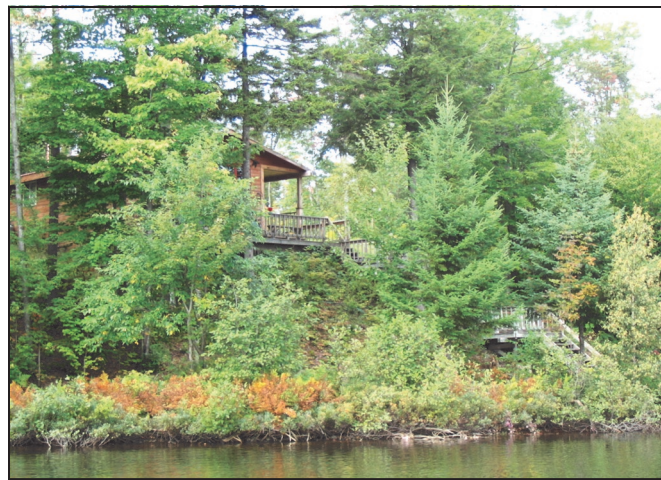
Conserving your shorefront for the long-term ensures that the efforts you make to protect, restore or enhance your lakeshore will continue into the future.