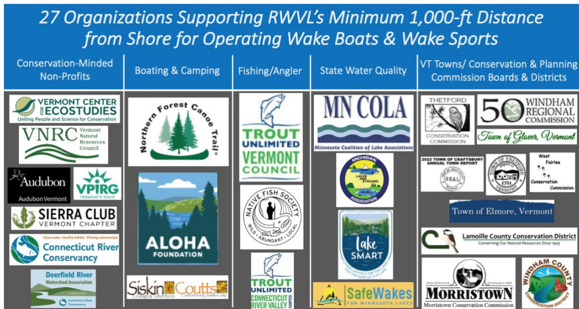
Figure 5. Public & private organizations supporting RWVL's 1,000-foot minimum operating distance