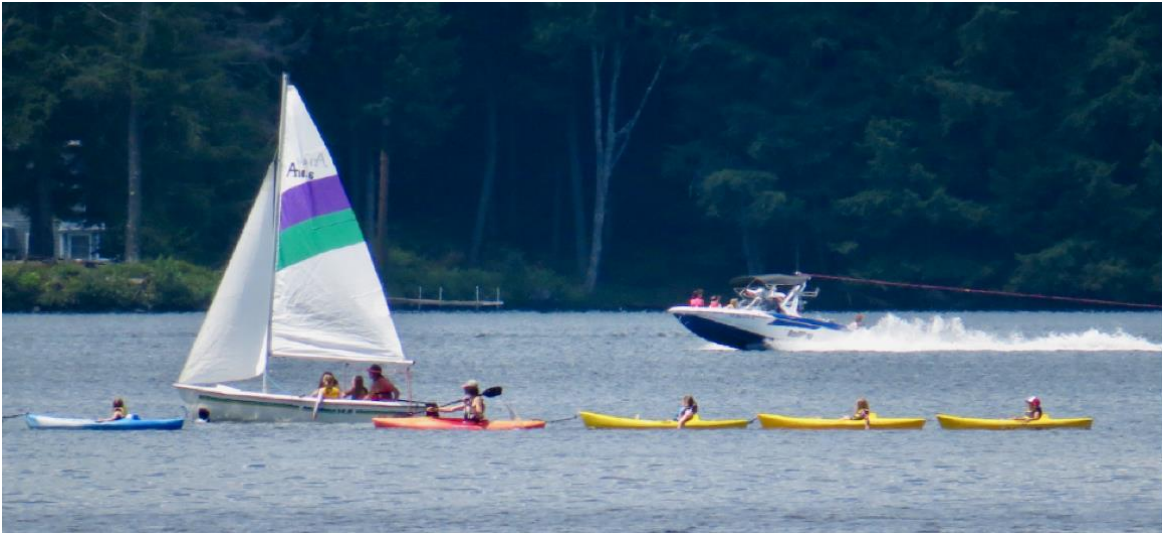
Figure 4. Vermont's green, environmental-friendly, robust tourist economy depends heavily on its clean, clear, safe lakes and ponds. Here kayakers, sailors, and a water skier safely share the lake