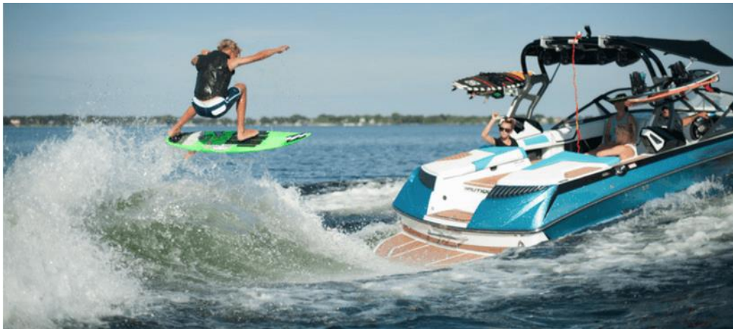
Figure 1. Appropriate wake surfing is being enjoyed >1,000 feet from shore, in water >20 feet deep, >200 feet away from other lake users, and with spotters and a wake boat driver

However, RWVL does not support DEC's proposed 500-foot minimum distance from shore for wake boat operation. Instead, RWVL continues to advocate for the 1000-foot wake boat operating distance recommended in our March 2022 petition to the Agency of Natural Resources (ANR). This distance better protects Vermont's inland lakes and ponds, as well as the people who use them, and is supported by scientific evidence. It also produces significant economic benefits and enjoys powerful community support. Those unfamiliar with wake boats and wake surfing ( Figure 1 ) are encouraged to view RWVL's 1-minute wake boat video . It is important to recognize that the UPWR that will be adopted in no way applies to tubing, waterskiing, or any conventional watercraft; it applies only to wake boats in which their ballast or other wave enhancing systems are employed. Wake boats that do not employ these systems can be used just as any other watercraft.